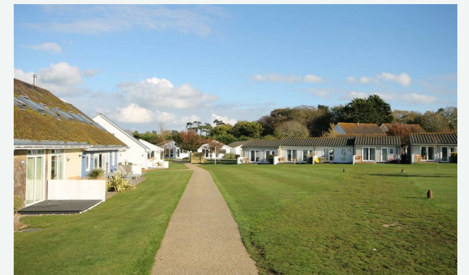
Whitfield P17, Yarmouth, Isle of Wight